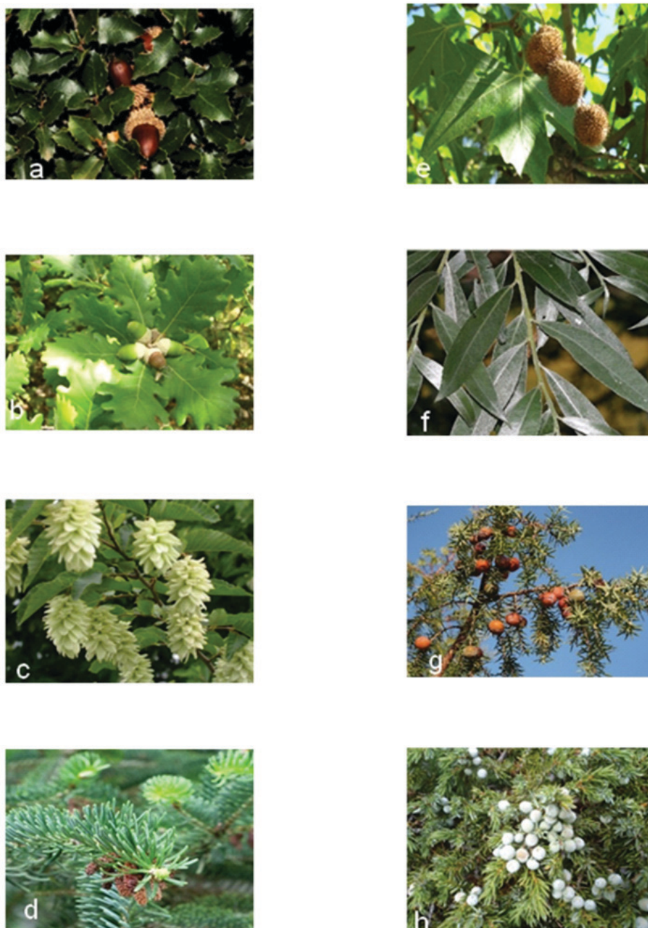
Fig. 1. Giona Mt vegetation a) Quercus coccifera (L.), b) Quercus pubescens (W), c) Ostrya carpinifolia (S), d) Abies cephalonica (L.), e) Platanus orientalis (L.), f) Salix alba (L.), g) Juniperus oxycedrus (L.), h) Juniperus communis subsp. Alpine.