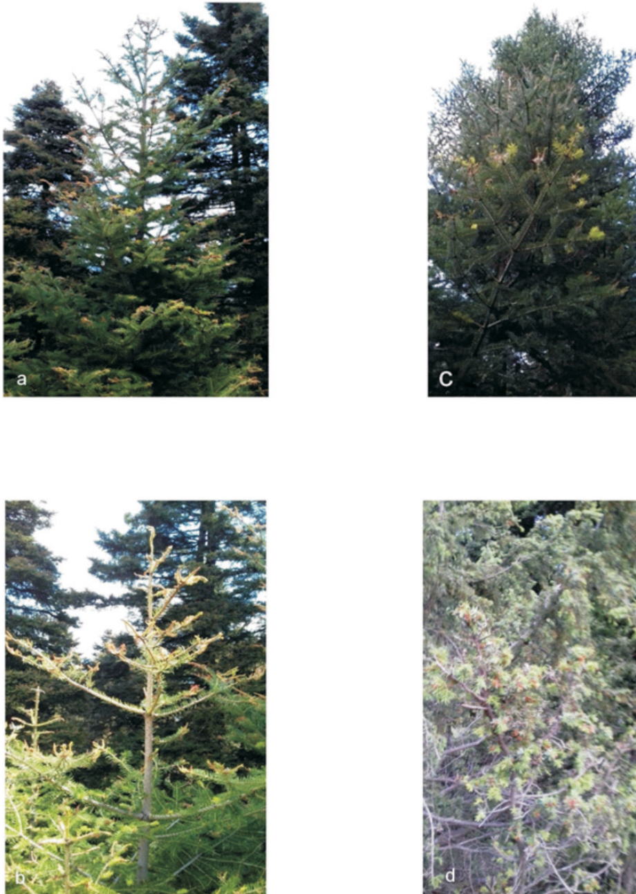
Fig. 3. Observed infestations of EFB on A. cephalonica (a, b, c) and J. oxycedrus (d).

ZENELI et al., 2001). Tree ring growth depends on species, age, heredity, and climatic conditions of the study site (VIEIRA et al., 2009), and the complex phenomenon of tree growth could therefore also be a factor of competition with neighbor trees and lianas, ingrowth of the stand, or genotypic variation in a particular area (COOK, 1987; ZWEIFEL et al., 2007; KOULELIS et al., 2022). PAPA-DOPOULOS (2016), using quantification and analysis of the inter-annual variability of fir site chronologies, have shown that the principal factor affecting tree growth at a latitudinal scale is climate. According to the tree ring-to-climate relationships examined by this author, late spring and summer precipitation is the main climatic factor affecting the growth of Greek fir populations.