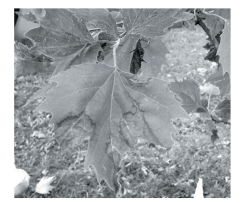
Fig. 4. Anthracnose symptoms on mature leaves often in V-shaped patterns

Anthracnose infection occurs at budbreak and during leaf expansion. Besides defoliation, symptoms include a brown leaf blotch associated with the leaf veins. The disease moves from the leaf to the twig where it produces a canker and causes dieback (Fig. 5). Repeated annual killing of twigs results in clusters of old dead twigs and live branches, "witches' brooms" (PILOTTI et al., 2002; TERRELL, 2004; NAMETH and CHATFIELD, 2007). On heavily infected trees dieback can be extensive leading to the gradual decline (Fig. 6) and death of the tree.