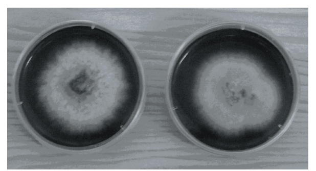
Fig. 2. Whitish to yellowy culture of Discula platani after 4-days cultivation on 2% malt extract agar

consisting of zones of elevated mycelium alternating with regions of mycelium adpressed to the agar surface. The raised regions have exudate droplets within the aerial hyphae and hard dark structures, resembling microsclerotia measuring 100-200 \ \mu m in diameter.