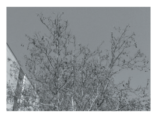
Fig. 6. Infection of expanding shoots and leaves results in gradual withering of affected plane tree

Acervules are formed on the leaves with ovoid to elliptical unicellular conidia. Next spring, the perithecia with ascospores developing on fallen leaves transfer the primary infection to young leaves.